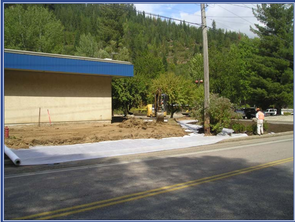
Remediation in Progress at Commercial Business, Big Creek Canyon