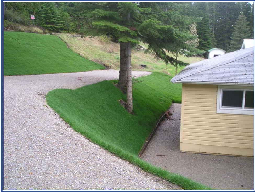
Completed Property Remediation in Wallace