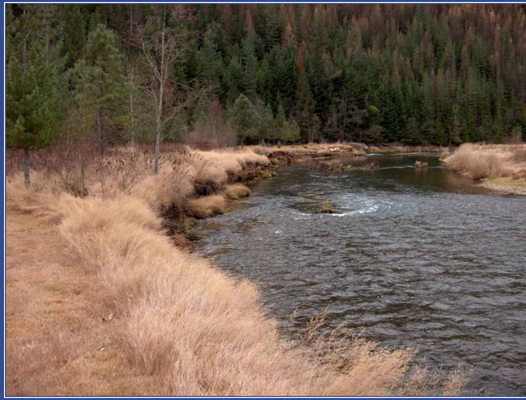
Coeur d'Alene River Stream Bank Erosion of Contaminated Soils