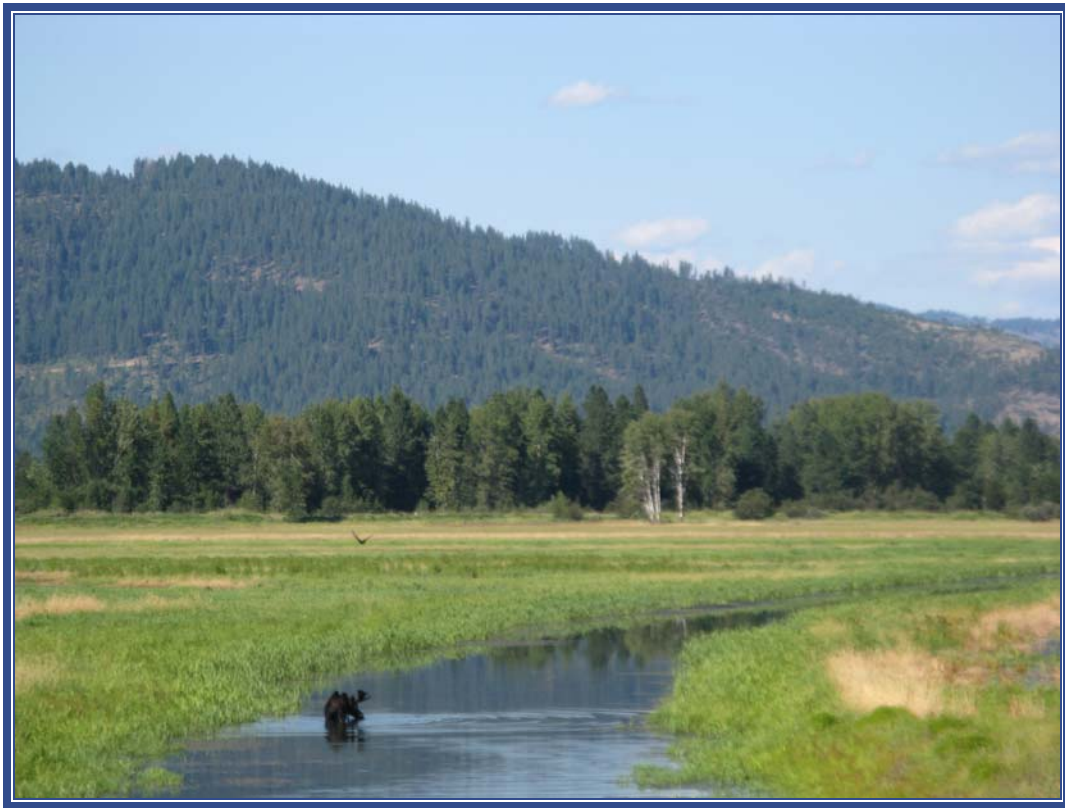
Lower Basin Wetland

Despite the large extent of mining-related contamination resulting in ecological and human health risks previously documented and work described in the 2002 ROD for OU-3, no additional remedial action Superfund money is currently designated for Lower Basin ecological remedies at this time. Some settlement monies received from the recent ASARCO bankruptcy settlement will be used to implement future cleanup projects in the Lower Basin after additional work planning has been conducted and contaminated sediment transport is better understood. In order to fully implement a comprehensive remedy in the Lower Basin, funding from the EPA Superfund program, ASARCO settlement monies, and other sources will be needed. The BEIPC will support EPA Region 10 in an effort to secure Superfund funding from EPA Headquarters.